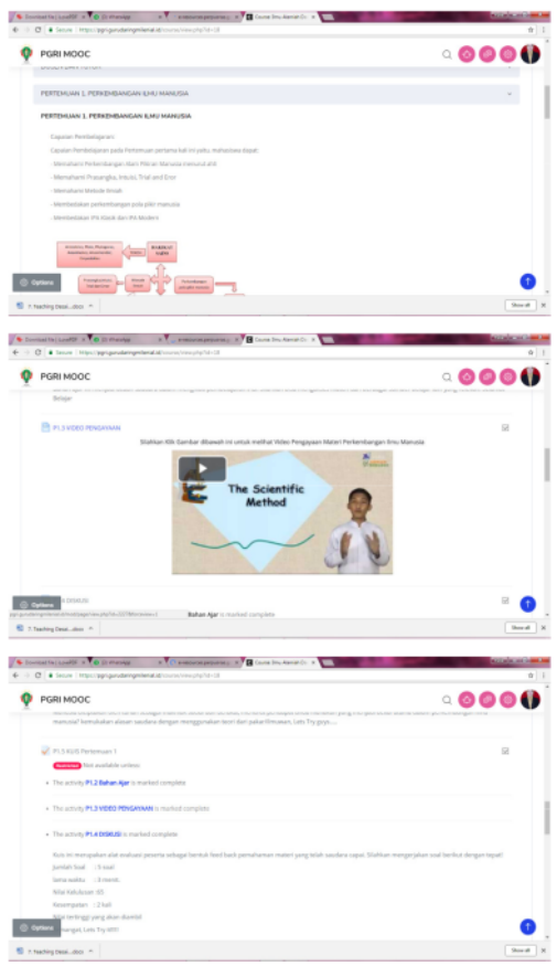
Figure 2. MOOC View

The 4th ICLIQE 2020, September 5, 2020, Surakarta, Indonesia