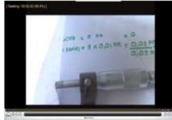
Figure 2. Concept about how to of result measurement