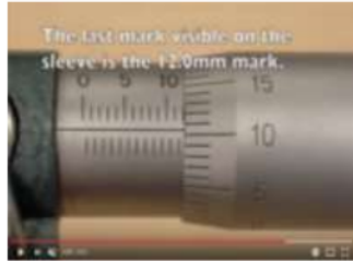
Figure 1. The concept about how calculate to read of measurement