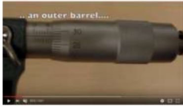
Figure 4. The Component of Micrometer