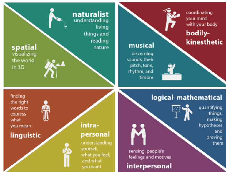
Figure 1. Illustration of Intelligence

Intelligence is how a human being is processing a problem. Intelligence includes how a sound mind is created. The word intelligence comes from the word smart. In accordance with its meaning that has a perfect meaning in which the development of one's human mind can be done to think, understand, and be sensitive to the environment. Intelligence will increase along with human development [11]–[13]. Figure 1 explains the illustration of the intelligence components.