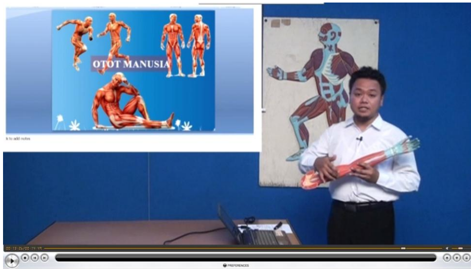
Figure 2. The Print Screen of Content Display on Human Muscles

At this level, the expert judgment, the result of the small-scale test, the result of the large-scale test suggested that the video clarifies the voice of the actors, brighter lighting, zoom in the object of the human skeletal and muscles, the actor use shorter and clearer language, adding the instrumental music.